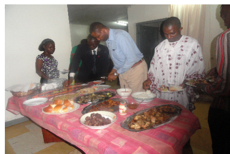
End of Year Fellowship

this new subject. The LADS Department is steadily advancing in its programme for the 2011/2012 academic year. The picture above shows members of this department in a recent orientation and harmonization working session.