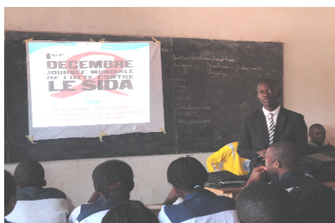
ILF Fights Against AIDS

2011 has been a great year to us and we are glad to bring you news that marked this last month of 2011.