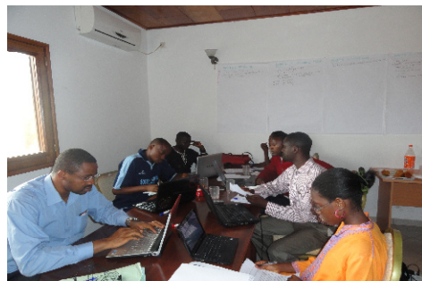
LADS Orientation and Harmonization

This month, the Young Leaders of "les SAPINS" and "IPONI" high schools, who passed the selection and recruitment test that was organized last November 2011, have been fully integrated in the Young Leaders club. During their integration ceremony, they vowed to be exemplary in all they do, and to incarnate the moral values and principles that are taught in the Young Leaders Clubs.