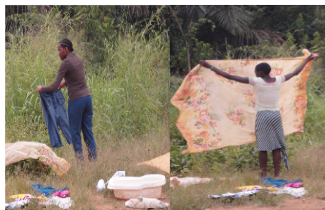
Visit to Orphanage

December 1 st of every year is the World AIDS Day. This year, the Young Leaders League organized weeklong activities in all partner schools to sensitize youths on the dangers of AIDS, on ways to avoid contracting the disease, and on the necessity to co-operate and assist those who are suffering from AIDS and relevant diseases. For this purpose, ILF produced and distributed a special lesson chart with illustrative diagrams and self-explanatory notes.